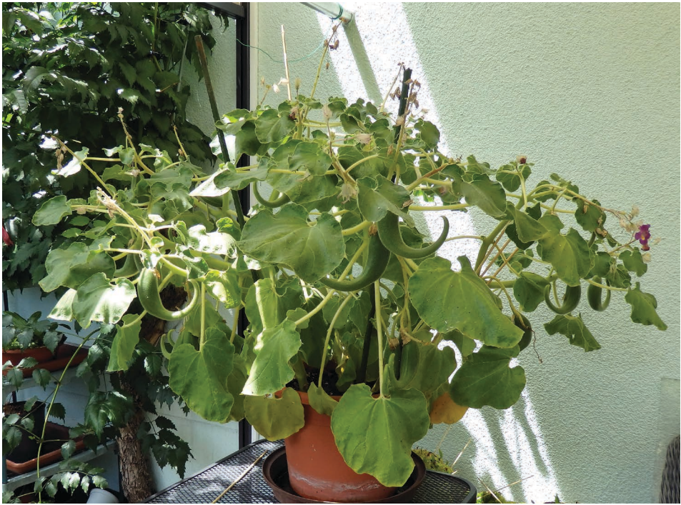
Figure 3: Proboscidea louisianica subsp. fragrans with Dicyphus errans population.

about it in a Slovenian book he wrote (Slatner 2019). In fact, he posted photos of the settlement in a Slovenian CP-forum as early as December 2008. Unfortunately, it was probably due to the language barrier that these early observations were not further examined. Remarkably, all photos sent to us, from northern France through Germany to Slovenia show identical bugs.