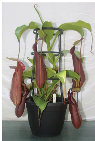
Plant not included

Ferocious Foliage P.O. Box 458 Dahlonega, GA 30533